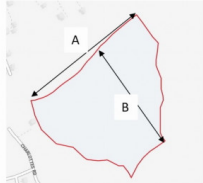
A = Bluff edge frontage, approx. 1390 ft. B = Approximately 1350 ft in depth.