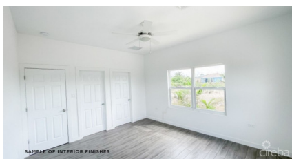
SAMPLE OF INTERIOR FINISHES