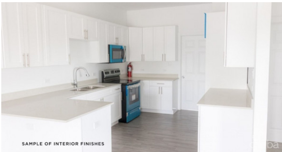
SAMPLE OF INTERIOR FINISHES