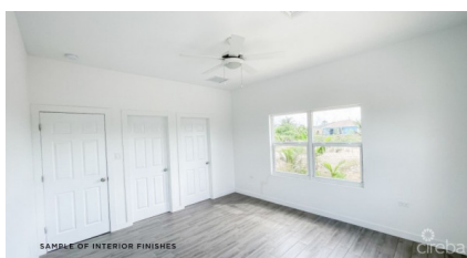
SAMPLE OF INTERIOR FINISHES