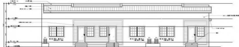
3 NORTH ELEVATION Scale: 1/8" = 1'-0"